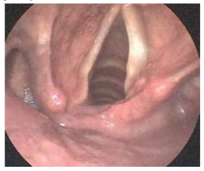
Figure 2. Fiberoptic bronchoscopy showing abductor palsy of left-sided vocal cord.

bronchial openings on both the sides were normal with no endobronchial pathology. Bronchial washing taken from the right middle lobe for cytological examination showed inflammatory and degenerated cells. Bronchial washings for AFB staining and culture for M. tuberculosis were negative. Transbronchial lung biopsy (TBLB) from the right middle lobe revealed thickened alveolar septa with mild lymphocytic infiltration, haemorrhage and focal carbon pigmentation. Magnetic resonance imaging (MRI) of the vagus nerve course was also normal (as the vagus nerve and its branches may contribute to the aetiology of vocal cord palsy). The MRI of recurrent laryngeal nerve did not show any entrapment phenomenon.